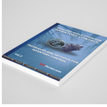
E-Book Vol. 2 Techniques And Methods for Inventory Control