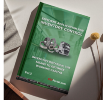
E-Book Vol. 3 Inventory Rotation, The Means to Optimize Working Capital