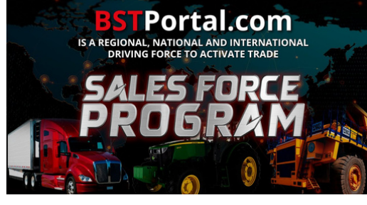
BST SALES FORCE