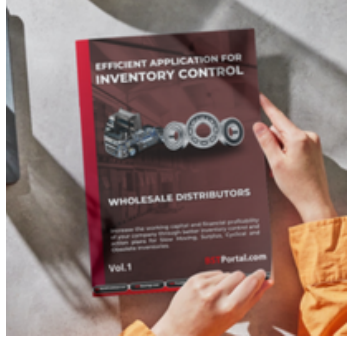
E-Book Vol. 1 Wholesale Distributors