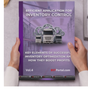
E-Book Vol. 4 Key Elements of Successful Inventory Optimization and How They Boost Profits