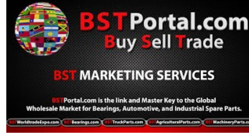
BST MARKETING SERVICES